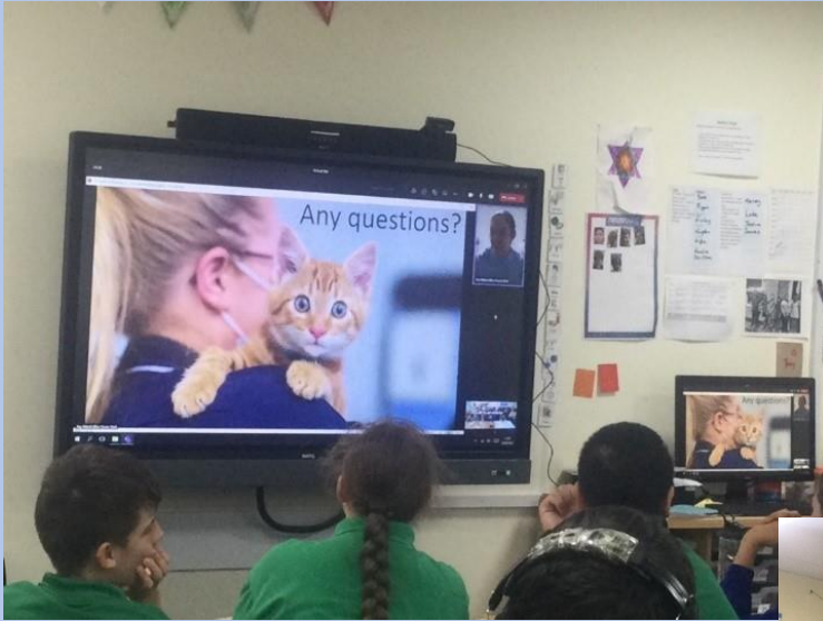
June 2021-Virtual Vet