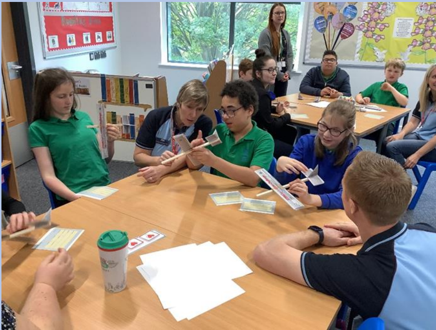
November 2021-RAF Glider Challenge.