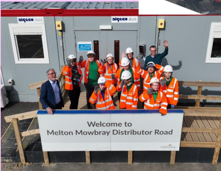
March 2024- Site visit to Galliford Try.