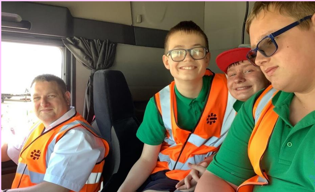
May-Snapdragon class visited the Culina/Fowler Welch site to learn about the life of a lorry driver