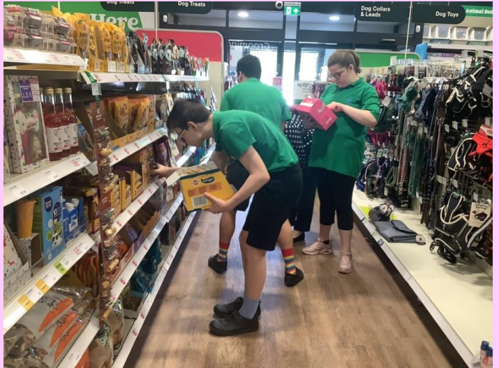
June 2024- Snapdragon class visited Pet's at home in Spalding.