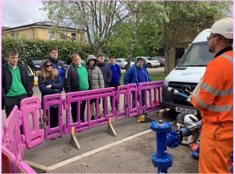
April 2024- Anglian Water visited school and demonstrated how they repair underground water pipes.